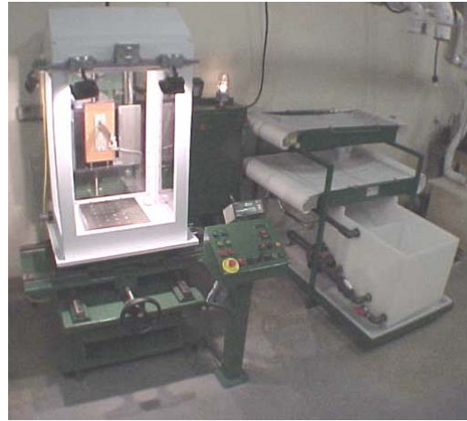
3-Axis, Batch Mode ECM Positioning System for the FARADAYIC Process

A 3-axis ECM positioning system was designed and built to accommodate batch mode part processing. This machine enables a contract services capability for its FARADAYIC Edge and Surface Finishing technology area, which is critical for processing evaluation parts for potential clients, as well as for pursuing services revenue from batch mode part processing. The cross-sectioned surface profile before and after ECM surface finishing for Ti-6Al-4V specimens indicate that the FARADAYIC Process improves the surface quality (such as reduction in surface roughness). The processing time for a successful removal can be very short, and often utilizes a water based electrolyte containing sodium nitrate ( \text{NaNO}_3 ) and sodium chloride ( \text{NaCl} ), the latter being essentially table salt.